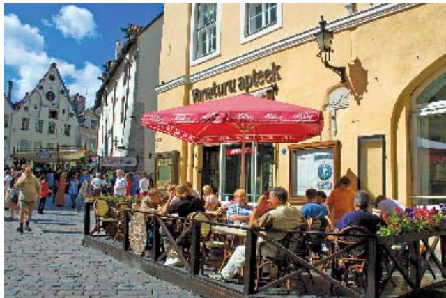
Vana Turg Street in Old Town Tallinn, Estonia

TALLINN, ESTONIA ■ RIGA, LATVIA KAUNAS & VILNIUS, LITHUANIA ■ GDANSK, POLAND