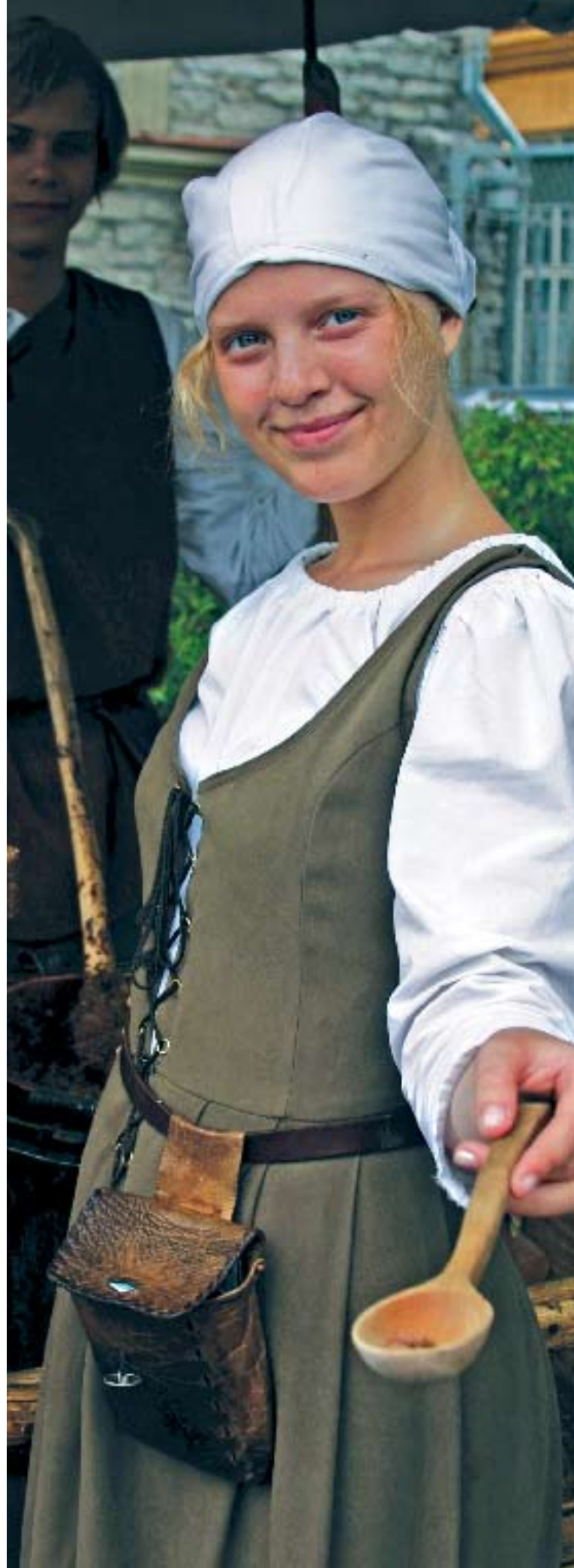
Photo at right: Estonian girl in medieval dress serving candied almonds at the medieval market

Package price is per person, based on double occupancy. Single supplement applies. Intra-tour air pricing is subject to change. International airfare is additional. Other restrictions may apply. Please see page 162 for terms and conditions.