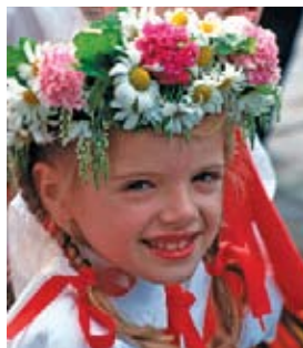
Latvian girl in festive attire

Estonia's capital city of Tallinn welcomes you with a stunning skyline of towers, spires, turrets and red-tiled roofs. Explore Tallinn's lower town with its 15th-century Town Hall and upper town with its famous Castle Toompea. Its well-preserved Old Town is a UNESCO World Heritage Site. □ Hotel Telegraaf, Tallinn